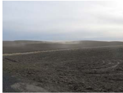
Spring work 2014