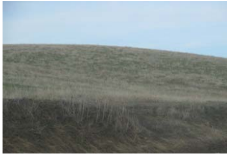
In CRP since 1990