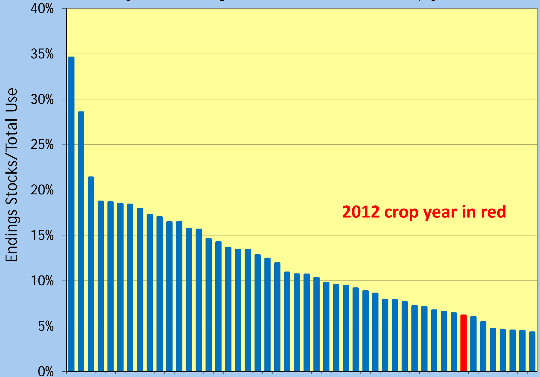
U.S. Soybeans Ending Stocks/Use, 1965-2012 crop years